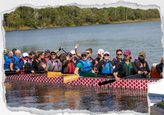
Dragon Boat Racing