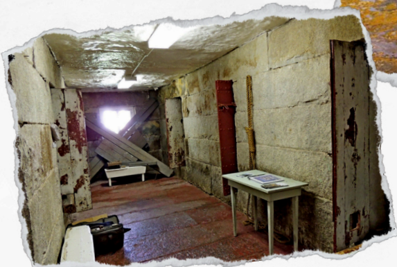
Historic Ghost Tour